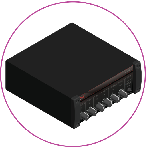
HD-MA35U 35 Watt Mixer Amplifier 4 Ohm / 8 Ohm

35 Watt Mixer Amplifier Powers Portable Classroom Audio System