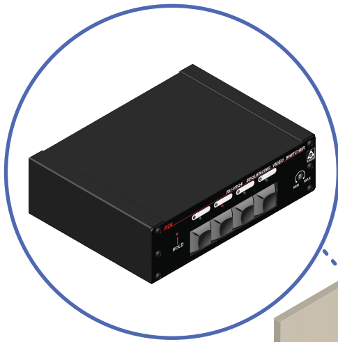
RU-VSQ4 Sequencing Video Switcher - 4x1 - BNC